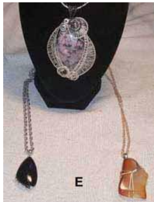
Picture E: Kat Koch displayed stones from the northwest that she used to make jewelry. Obsidian, Rhodonite and Carnelian.

Raffle Drawing: There was 20 tickets called and the winner could chose which item they wanted.